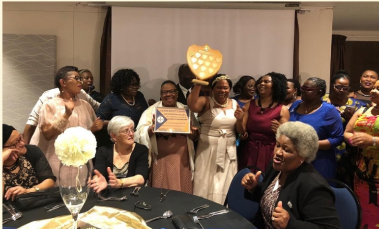
Hands of Grace