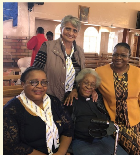
AWF Presidents with one of the AWF stalwart