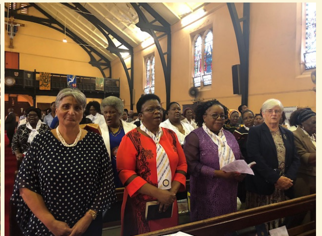
Diocese of Grahamstown Choir