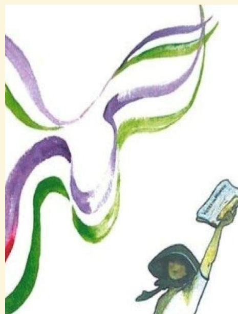
AWF Provincial Theme 2018 -2020