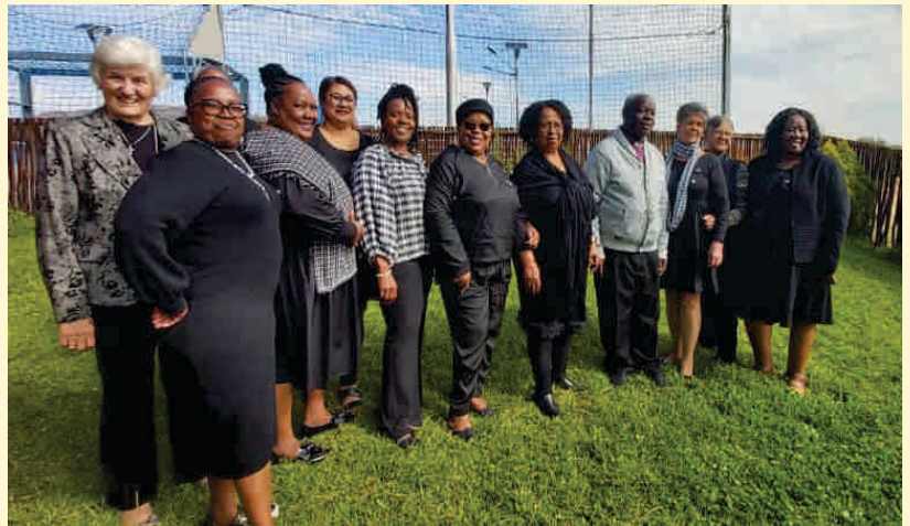
PEXCO members wearing in black as a symbol of solidarity against GBV