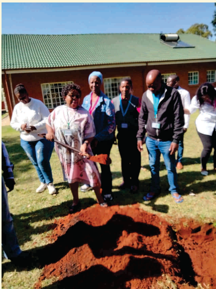
Towards the end of a prayerful day, the urgency of protecting the environment was displayed by the planting of a tree as shown in the picture above