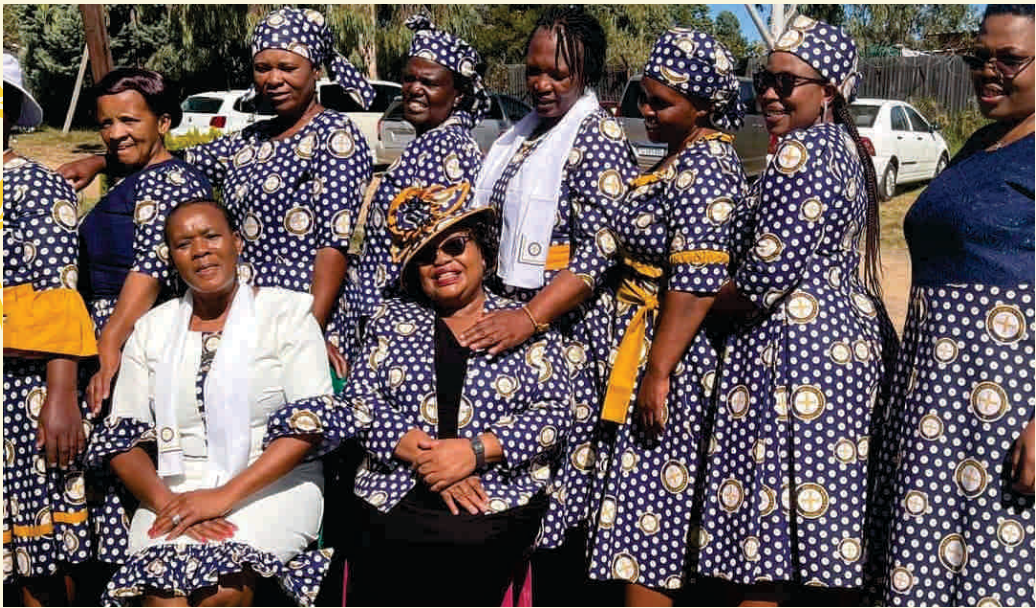
President with Lesotho ladies