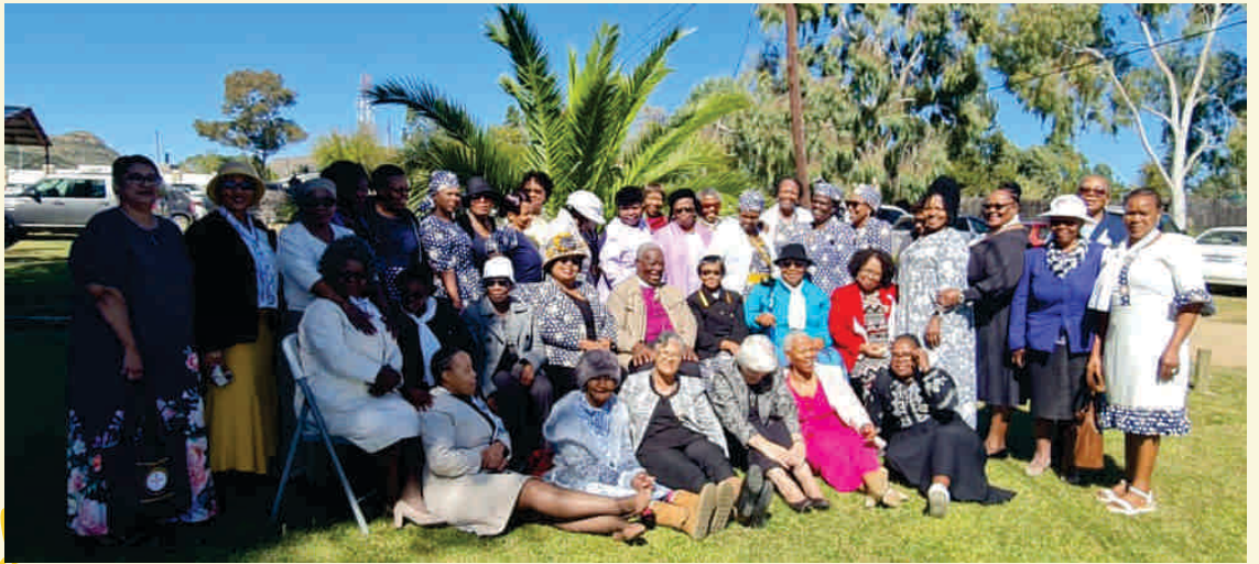
PEXCO members with Lesotho AWF members