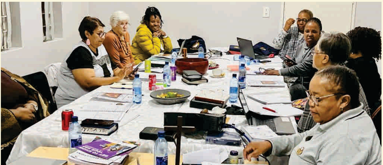
PEXCO members working hard during PEXCO meeting in Lesotho