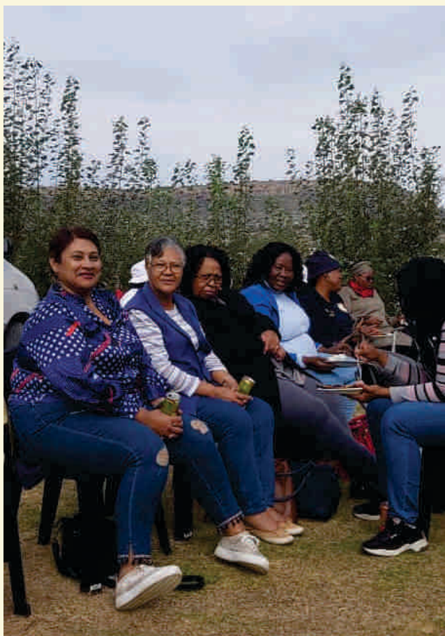
PEXCO members chilling with AWF members from Lesotho