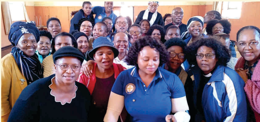
Some AWF members of the Diocese of Grahamstown elective AGM