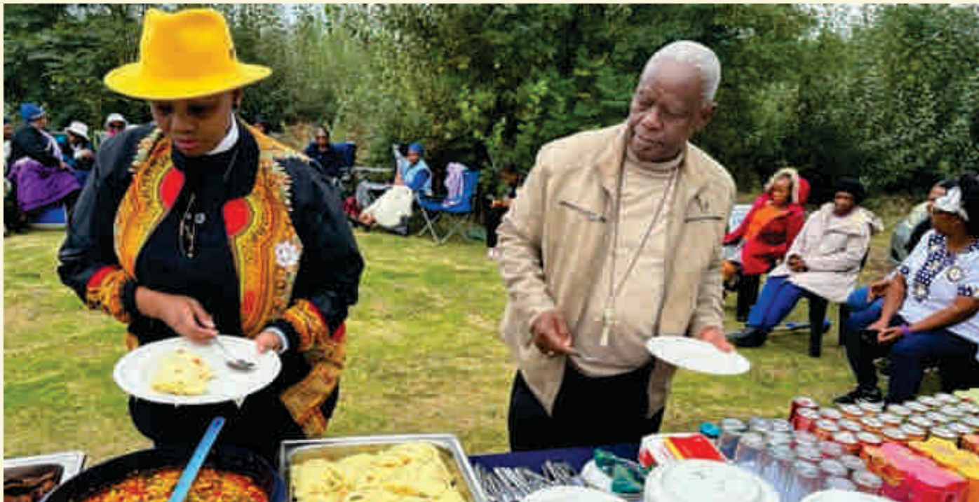
The Bishop of Lesotho and the AWF Liaison Bishop