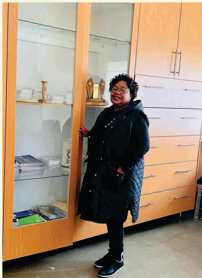
AWF office renovated with new furniture