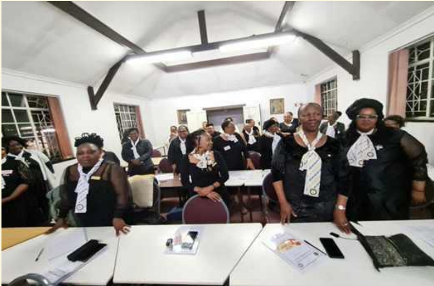
Diocesan Presidents wearing black on Thursday 19 October during the PEXCO and Presidents Meeting in October 2023 as a symbol of strength and courage representing their solidarity with victims and survivors of violence and calling for the world without rape and violence.