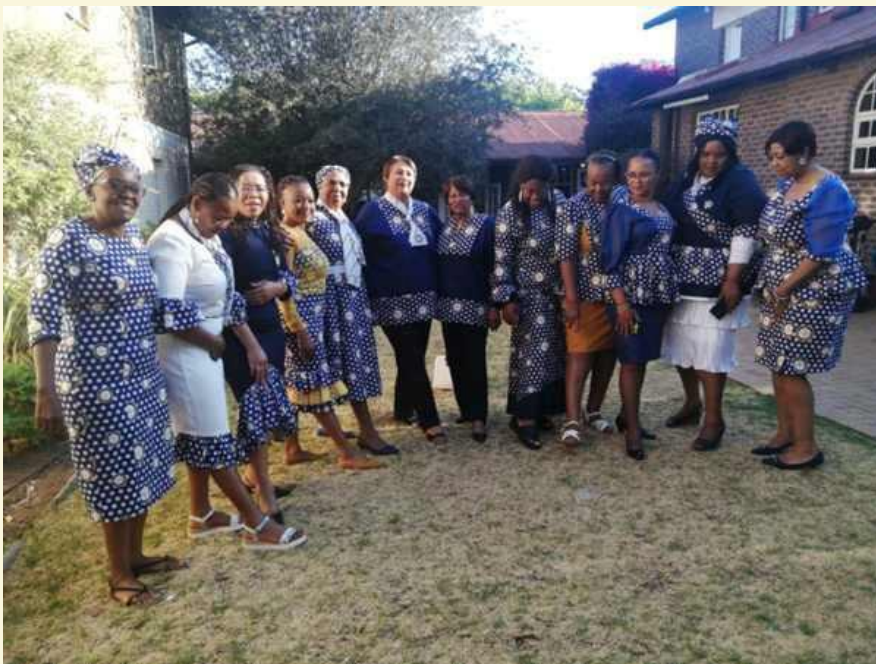
Presidents showcasing designs of the AWF promotion material.