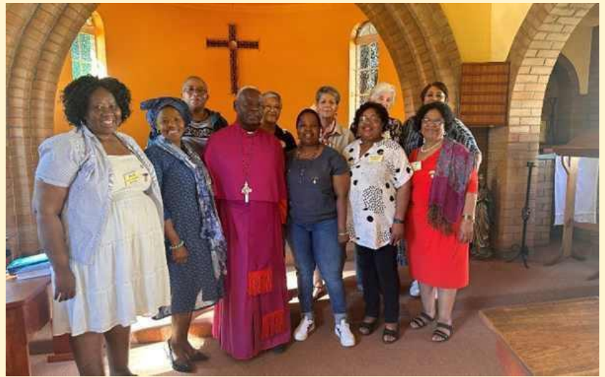
PEXCO at the Meeting in October 2023