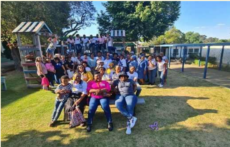
PEXCO and Presidents chilling with children at St Mary Children's Home in Rosettenville